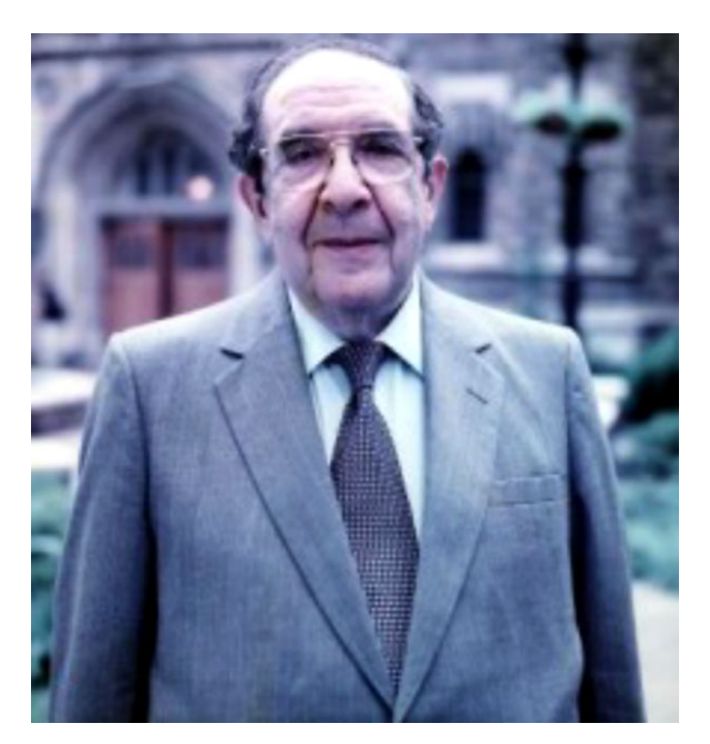
Figure 1. Ronald S. Rivlin [1915–2005]. (Online version in colour.)

along with their students and collaborators, were at the forefront of the development and application of continuum mechanics.