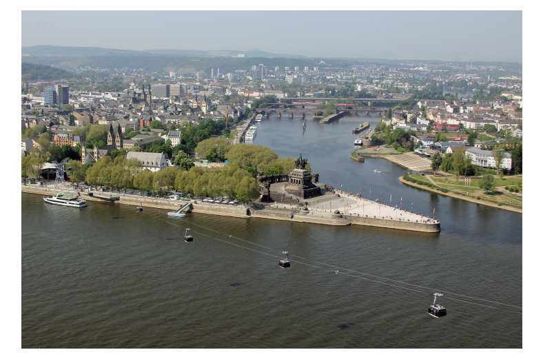
Figure 1: Confluence of rivers, the Mosel flows into the Rhine at Koblenz

Shallow water equations describing unsteady open channel flows are typically used to model river flows. Conservative form of the equations are difficult to numerically formulate and apply in real test cases (Eq. 1 in [?]). On the other hand, the non conservative form of the equations are easier to formulate numerically (Eq. 3 in [?]). There have been various attempts to handle both these formulations. It is important to note that the one dimensional model decreases the computational cost significantly to model river flows to a reasonable accuracy as compared to a more comprehensive 2D resolution. The problem becomes tricky when there is confluence of river segments/channels (Fig. 1). Work has been done to handle merging of flows from different