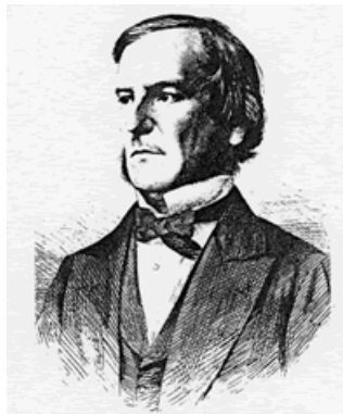
George Boole (1815–1864) first Professor of Mathematics at UCC.